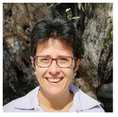
Analytical Performance Specification for EQAS